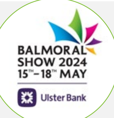
NI Food & Drink Pavillion

The 'Balmoral Buzz' wouldn't be complete without the tantalising tastes of the NI Food and Drink Pavilion as well as the catering areas across the showgrounds. From mini tasters to food on the go and cooking demonstrations within the Pavilion and the Healthy Horticulture Area, food lovers can enjoy an array of treats and tastes each day.